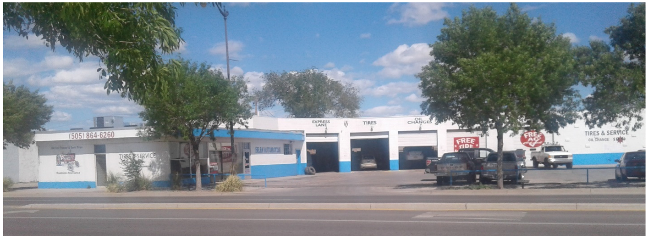
Figure 1 Existing building at Main and Dalies

This month we are featuring some ideas for developing what I believe is one of the best retail locations in Belen. This lot is on the northeast corner of Main Street and Dalies Ave. Currently it is being used as a tire store.