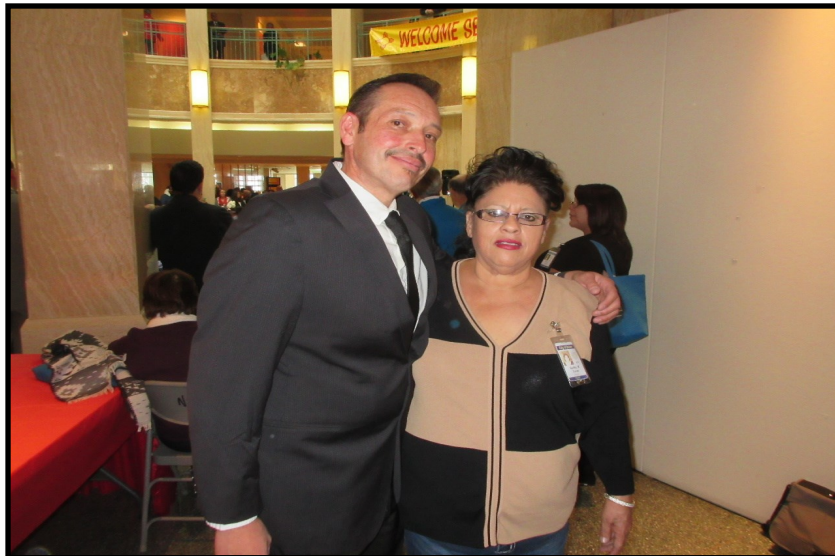
2017 Volunteer Luncheon