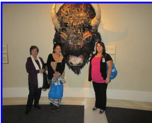
Senior Day at the Round House