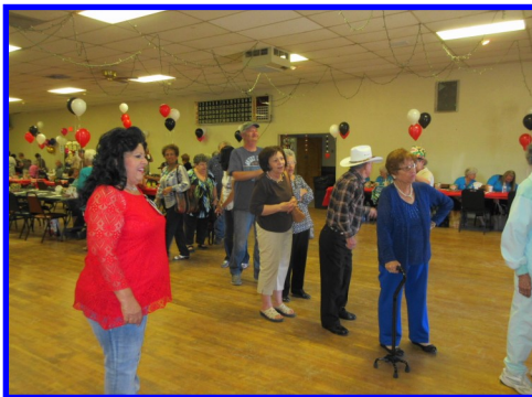
2017 Volunteer Luncheon