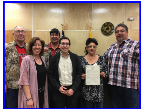
National Service Recognition