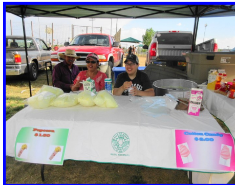
Vendor at the 4th of July